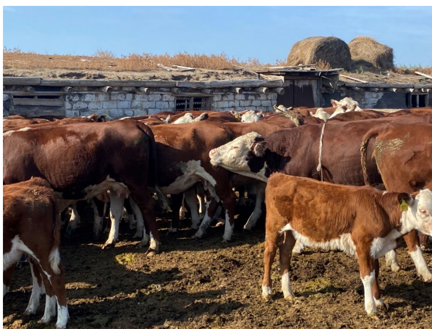
Figure – 2 Identification of sexual hunting with the help of a stud bull with apron

Also, when using the synchronization scheme according to the Ovsynch method with the addition of biologically active substances, although the arrival of cows in hunting was lower (52.6±2.18%), for, fertilization in the group was higher by 3.9% (78.9±1.78%) than with the Hitsynch method without the use of biologically active substances (Figure 2).